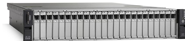
Figure 1. Cisco UCS C240 M3 Server

The Cisco UCS C240 M3 interfaces with Cisco UCS using another Cisco innovation, the Cisco UCS Virtual Interface Card. The Cisco UCS Virtual Interface Card is a virtualization-optimized Fibre Channel over Ethernet (FCoE) PCI Express (PCIe) 2.0 x8 10-Gbps adapter designed for use with Cisco UCS C-Series Rack Servers. The VIC is a dual-port 10 Gigabit Ethernet PCIe adapter that can support up to 256 PCIe standards-compliant virtual interfaces, which can be dynamically configured so that both their interface type (network interface card [NIC] or host bus adapter [HBA]) and identity (MAC address and worldwide name [WWN]) are established using just-in-time provisioning. In addition, the Cisco UCS VIC 1225 can support network interface virtualization and Cisco ® Data Center Virtual Machine Fabric Extender (VM-FEX) technology.