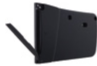
RT10-CAC - AVAILABLE IN US AND EUROPE ONLY

Replacement capacitive stylus with tether.