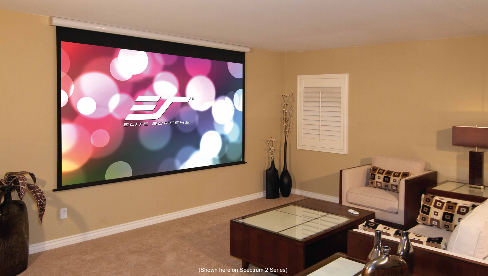
(Shown here on Spectrum 2 Series)

MaxWhite® Fiberglass (FG) is fiberglass backed for added stiffness which provides the flattest possible non-tensioned screen surface with universal applications. This material provides wide viewing uniform diffusion while giving precise definition, color reproduction and black & white contrast. The screen surface has a black-backing to eliminate light penetration, is mildew resistant and washable with mild soap and water.