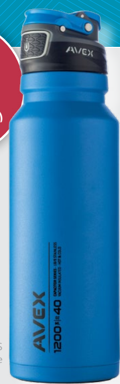
Avex Freeflow SS 1200ML Water Bottle