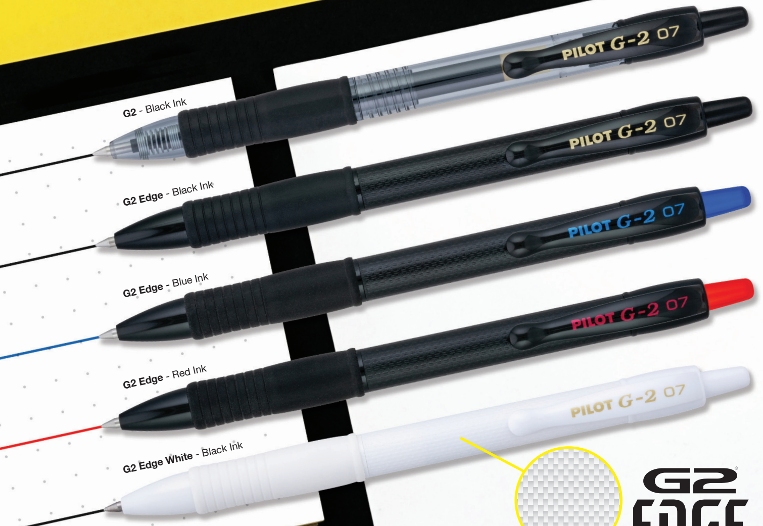
G2 - Black Ink