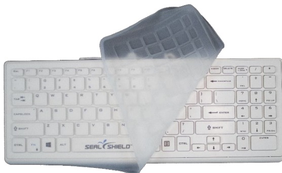
Fitted Easy Clean Cover