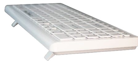
The two feet at the front of the keyboard allow for a decline