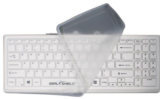
Flat Easy Clean Cover