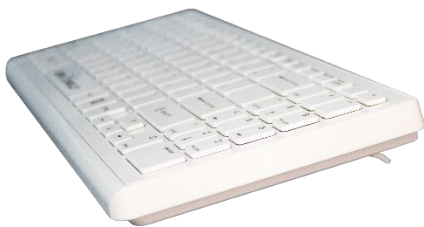
The two feet at the back of the keyboard allow for an incline