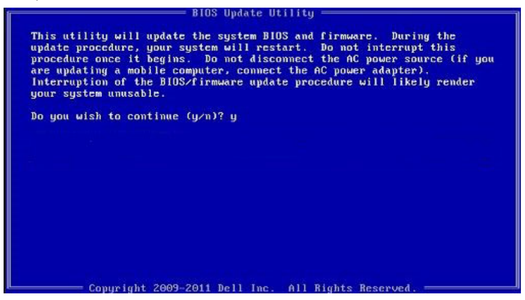
Figure 1. DOS BIOS Update Screen