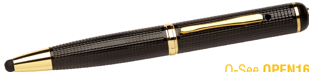
Q-See QPEN16 Compact DVR Camera Pen

It stores nearly 14,000 pictures or 1.5 hours of video on the internal 16GB memory. You can view or save your files on any PC with a USB port. The pen can be recharged with the included charger or from a computer's USB port. The ease of use, small size and elegant design make this a valuable tool for security personnel, business people, students, tourists and others.