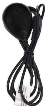
Figure 5: IR blaster extension cable (IR OUT)

The IR Extension feature allows you to control your HDMI source device from a remote location.