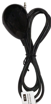
Figure 6: IR receiver extension cable (IR IN)