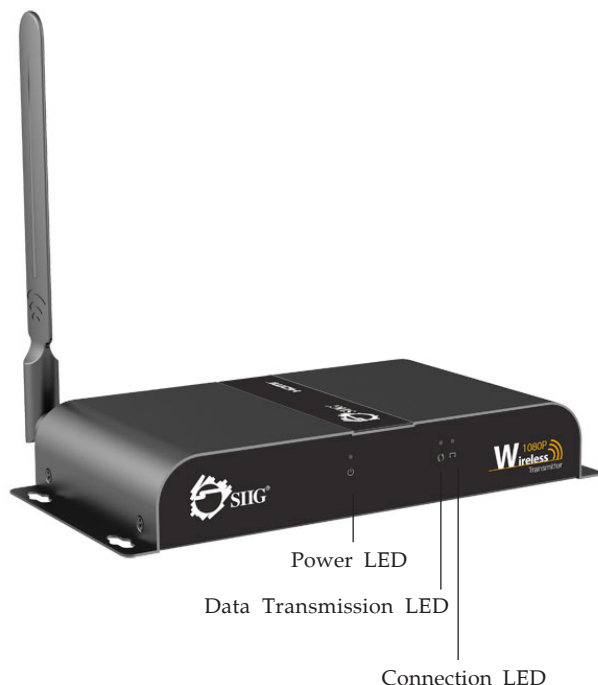
Figure 1: Transmitter (TX) - front side