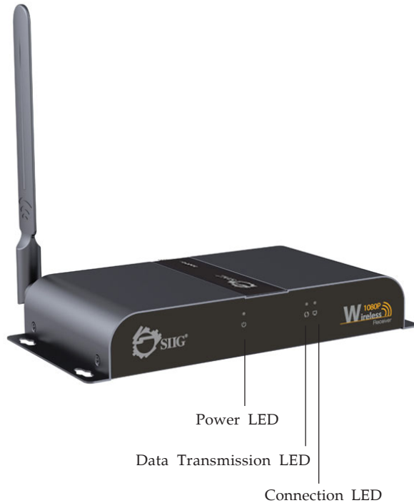
Figure 3: Receiver (RX) - front side