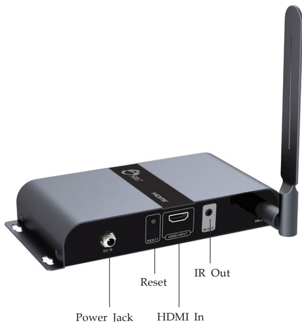
Figure 2: Transmitter (TX) - rear side