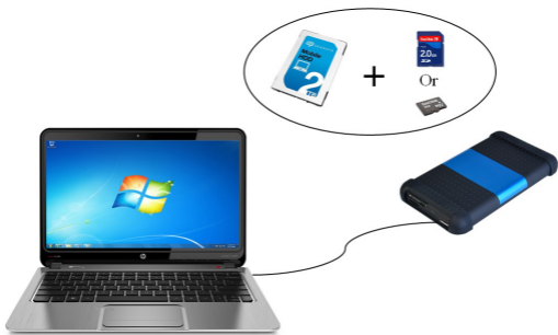
Figure 7: Application

Note: Only one memory card can be inserted at any one time.