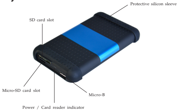
Figure 1: USB 3.0 to SATA Hard Drive with SD Reader Enclosure - 2.5