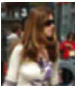
Image lacks detail with little or no facial feature recognition and a non-readable license plate.