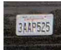
More than 40 PPF

Not all facial features can be made out. Plate numbers can be read but not state.