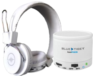
SoundTRAX Bluetooth Stereo Headphones

Check out these other products from Blue Tiger! Check with your retailer for availability or go to bluetigerusa.com .