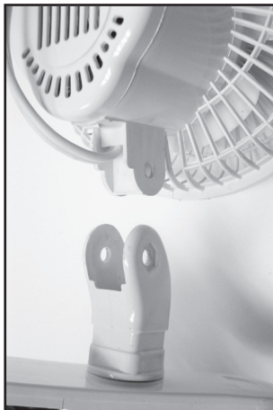
Place Clip Base on to Fan