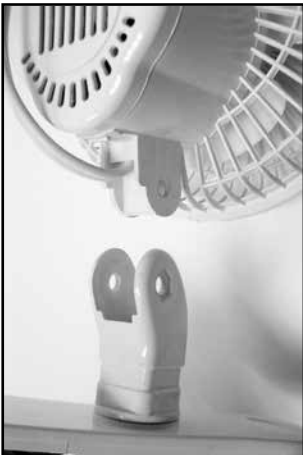
Place Clip Base on to Fan