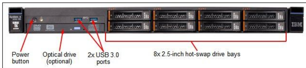
Figure 2. Front view of the IBM System x3250 M5 with eight 2.5-inch hot-swap drive bays

The following figure shows the front of the server with eight 2.5-inch hot-swap drive bays (models with 2.5-inch simple-swap or 3.5-inch simple-swap or hot-swap drive bays are also available).