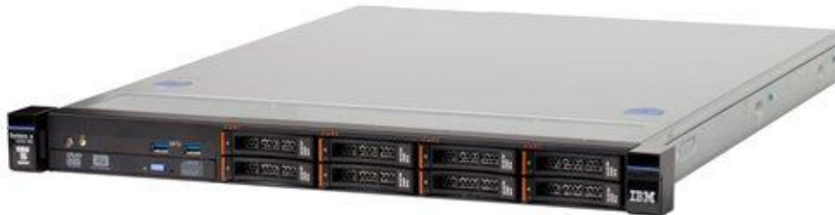
Figure 1. The IBM System x3250 M5

The following figure shows the IBM System x3250 M5.