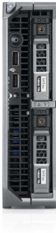
Figure 1. M520 front view

The chassis design of the M520 is optimized for easy access to components and for airflow for effective and efficient cooling. Figure 2 shows the M1000e chassis enclosure populated with M520 modules.