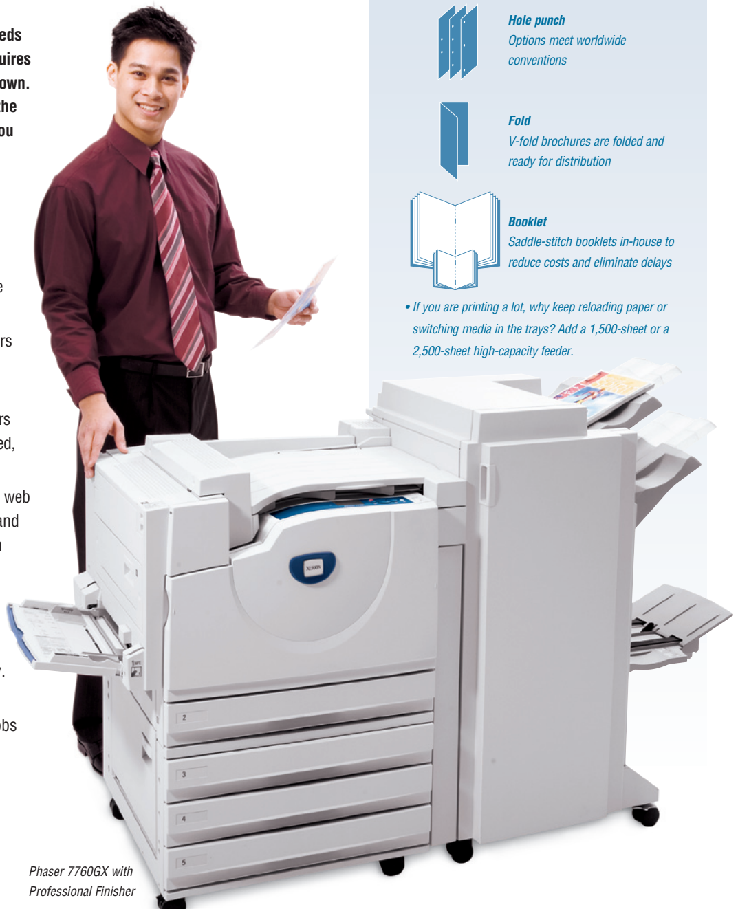
Phaser 7760GX with Professional Finisher