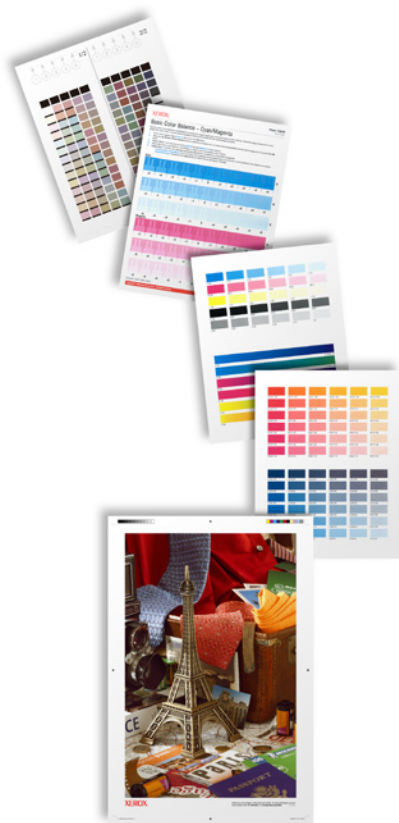
Built in color calibration tools give you the final output you want.

High-quality, consistent color is crucial when you rely on stunning visuals to convey your ideas and concepts. That's why the Xerox Phaser 7760 color printer is the designer's choice. It offers brilliant color, blazing speeds and easy-to-use features that make the most of everything you print.