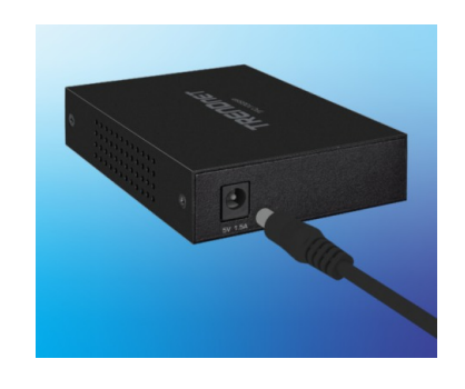
Power Adapter A power adapter is included with the 10G SFP+ transceiver for standalone use.