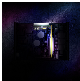
PATENTED PLANAR TRANSFORMER