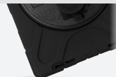
CORNER DROP PROTECTION