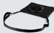
OPTIONAL HORIZONTAL OR VERTICAL NECK STRAP AVAILABLE