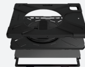
TRIPLE LAYER PROTECTION