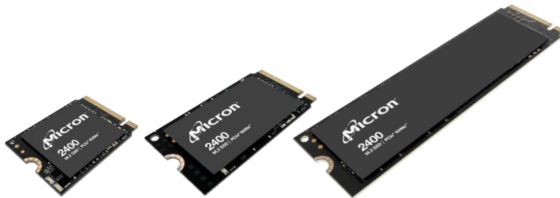
Micron 2400 SSD 22x30mm

Available in three compact M.2 form factors with capacities up to 2TB, the Micron 2400 SSD delivers improved storage density, affordability, and flexibility 2 without compromising the user experience.