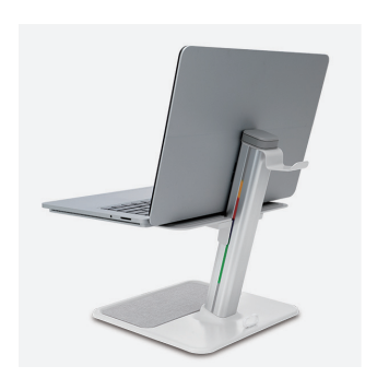
Sturdy Metal Construction

A fabric-covered cutout conveniently and neatly houses a docking station, phone, or other accessories (to ensure accessibility to all ports, a 90-degree port adapter may be necessary for some docking stations).