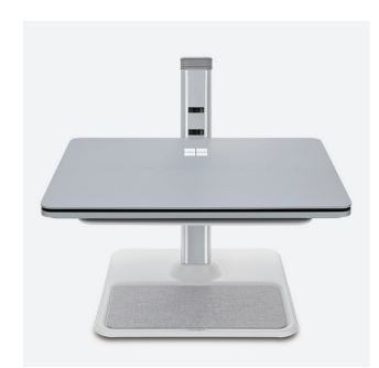
Non-Slip Rubber Base

Assembly takes minutes, with all the tools you need included.