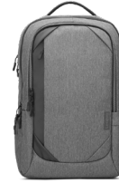
Lenovo Business Casual 17-inch Backpack PN: 4X40X54260