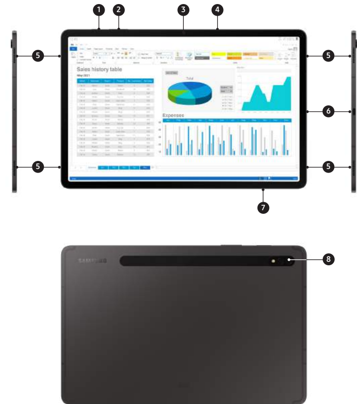
Galaxy Tab S8