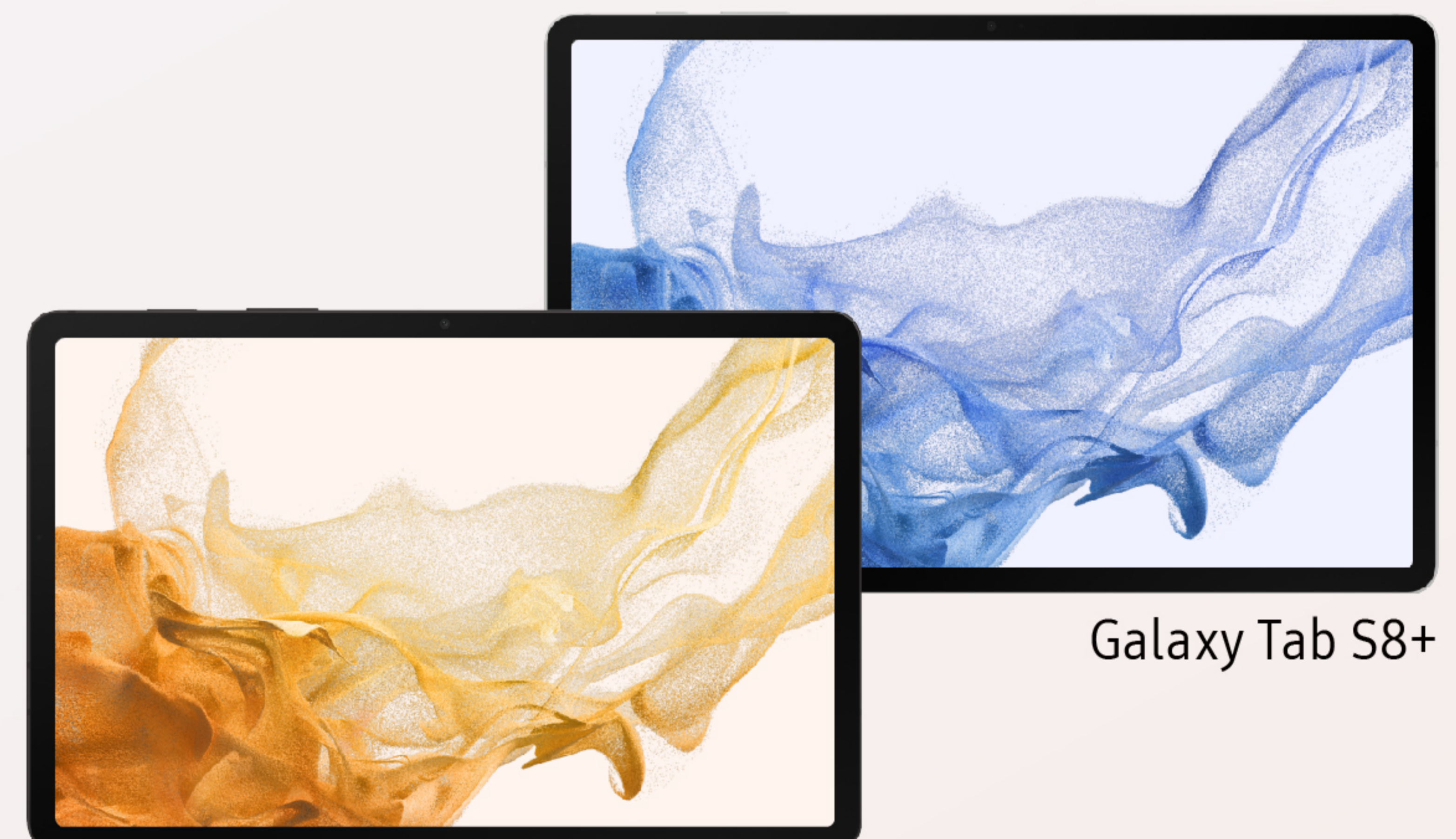
Galaxy Tab S8

S Pen (BLE, Inbox) Book Cover Keyboard, Book Cover, Protective Standing Cover