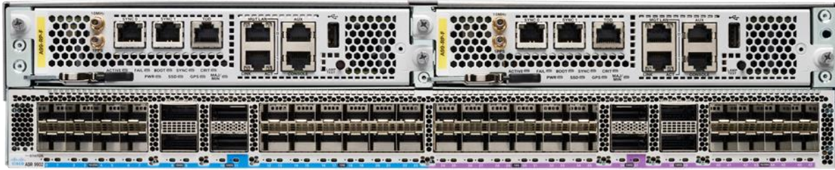
Figure 1. Cisco ASR 9902 chassis