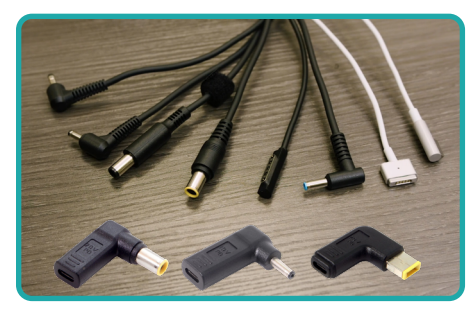
Emulator Adapter Cables

The Elevate line of carts features all of the key considerations of what schools need in a charging cart. They weigh significantly less than other carts, feature a smaller footprint, and with all swivel casters, they are easier to maneuver in the classroom. Best of all, with Quick-Sense USB-C charging technology, they eliminate the need for wiring AC adapter charging cables.