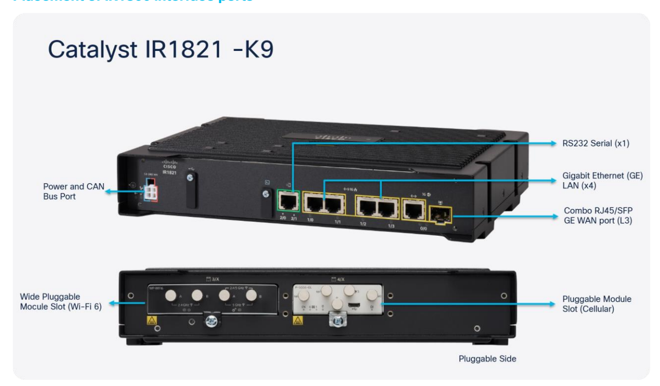
Figure 3. IR1821-K9 interface ports