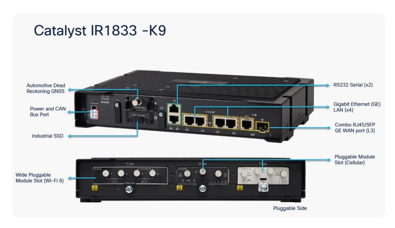
Figure 5. IR1833-K9 interface ports