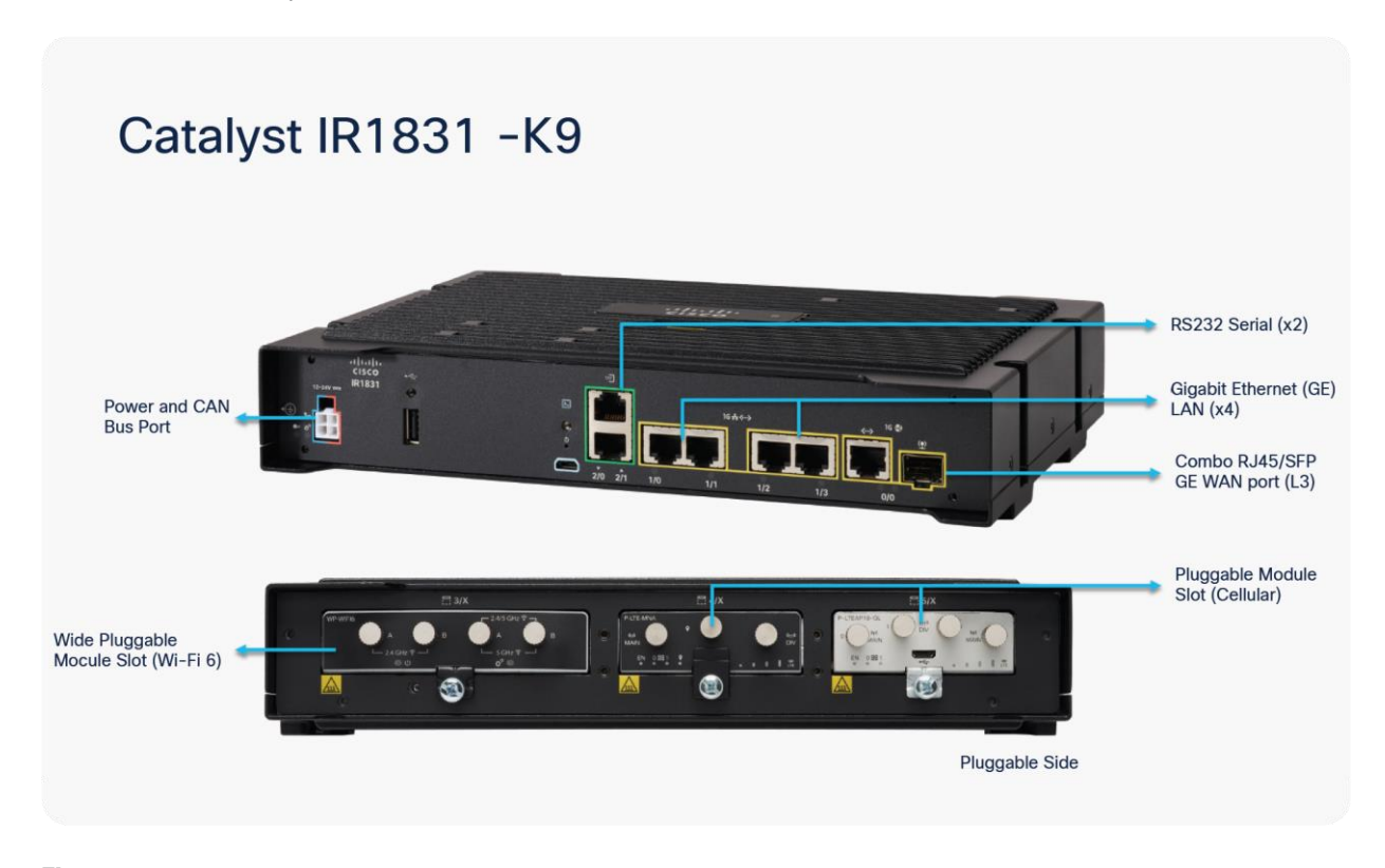
Figure 4. IR1831-K9 interface ports