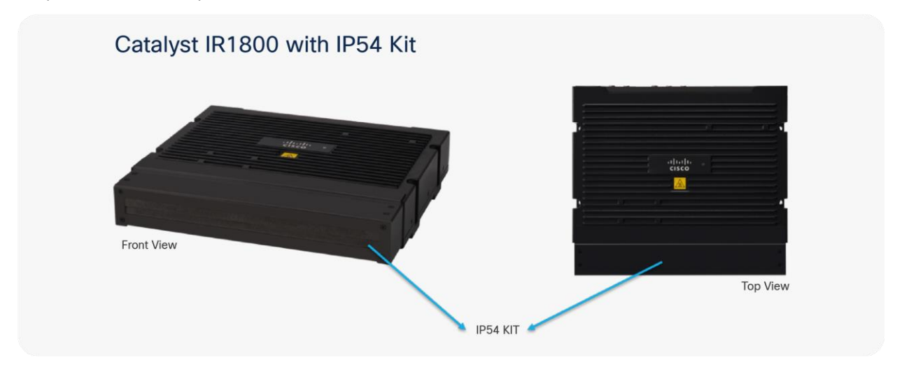
Figure 10. Catalyst IR1800 with IP54 kit

The IR1800 Series is IP40 rated by design. This IP rating can further be improved to IP54 with an additional IP54 kit (IR1800-IP54-KIT).