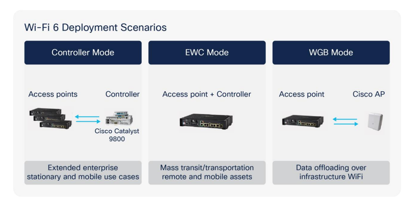
Figure 9. Wi-Fi 6 deployment scenarios