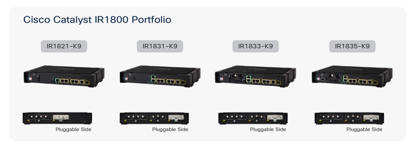
Figure 2. Models in the Catalyst IR1800 Series

Cisco Catalyst IR1800 Rugged Series Routers are best-in-class ruggedized routers designed for assets that are mobile or on the move, stationary or remote. These highly flexible and modular routers are 5G ready and adopt the latest Wi-Fi 6 standards. The IR1800 Series consists of four models: IR1821-K9, IR1831-K9, IR1833-K9, and IR1835-K9.