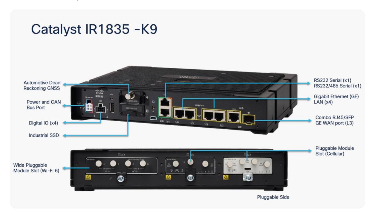
Figure 6. IR1835-K9 interface ports