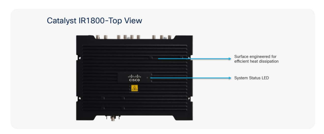
Figure 7. Top view

The Catalyst IR1800 Series also introduces Wi-Fi 6 in a pluggable form factor. This ruggedized wide pluggable module provides the latest in Wi-Fi technology and is compatible with the latest wireless controllers from Cisco. The module can run in Control and Provisioning of Wireless Access Points (CAPWAP) mode and Embedded Wireless Controller (EWC) mode, as well as Work Group Bridge (WGB) mode.