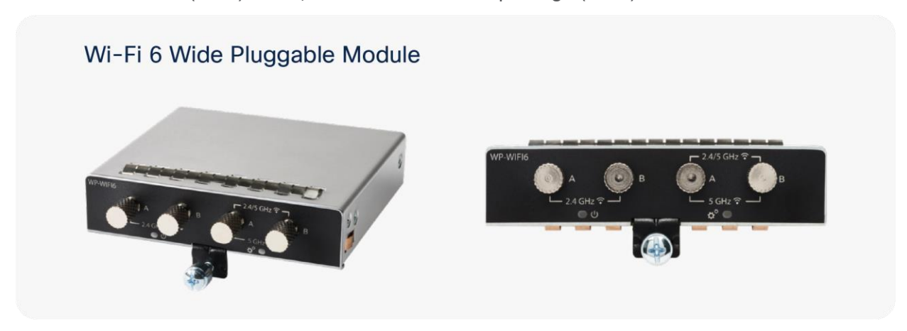
Figure 8. Wi-Fi 6 wide pluggable module

The Catalyst IR1800 Series also introduces Wi-Fi 6 in a pluggable form factor. This ruggedized wide pluggable module provides the latest in Wi-Fi technology and is compatible with the latest wireless controllers from Cisco. The module can run in Control and Provisioning of Wireless Access Points (CAPWAP) mode and Embedded Wireless Controller (EWC) mode, as well as Work Group Bridge (WGB) mode.