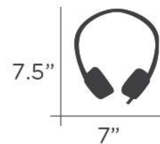
Dimensions 7.5" x 2.375" x 7"