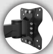
VESA 75x75 / 100x100 Compatible