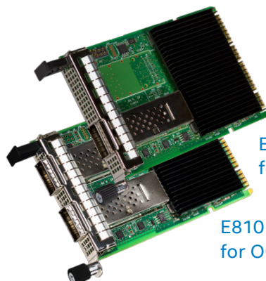
E810-CQDA1 for OCP 3.0