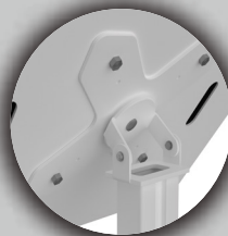
VESA Plate Flexible

Whether you need a sturdy, multifunctional floor stand for healthcare, retail, hospitality, or events, CTA's Mobile Floor Stand holds everything you need. Included in this kit is our bestselling Paragon Premium Locking Enclosure (PAD-PARAW), which provides a secure, sloped tablet mount with enough room underneath to safely hide peripheral power banks or USB hubs. The sturdy base is comprised of five smooth-rolling casters that can be locked in place. This stand includes attachable keyboard tray and handy basket, all easily affixed with included mounting kit. At the rear of the unit, you'll find a useful handle, which aids in simple navigation. Two brackets at the base of the stand provide a safe place to route cables. An adjustment knob lets you set the height of the tablet mount for the comfort of any user.