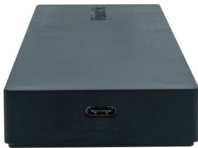
USB-C to System Port