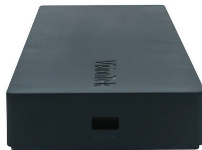
Kensington™ Lock Slot