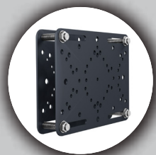
Wide Range of VESA Patterns on Plate