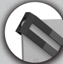
Unique Corner Grip allows for Accessibility to all Ports