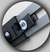
Anti-Theft Lock & Key Security