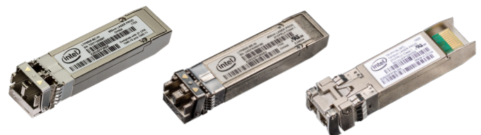
Intel® Ethernet SFP28 Optics (SR, and SR and LR extended temp)