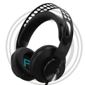
Lenovo Legion H300 Gaming Headset

* Example of Lenovo Legion catalogue naming convention