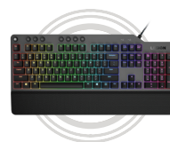
Lenovo Legion K500 Gaming Keyboard