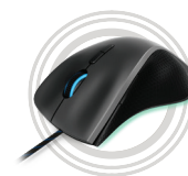
Lenovo Legion M500 RGB Gaming Mouse