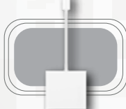
Lenovo USB-C 3-in-1 Hub