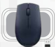
Lenovo 520 Wireless Mouse