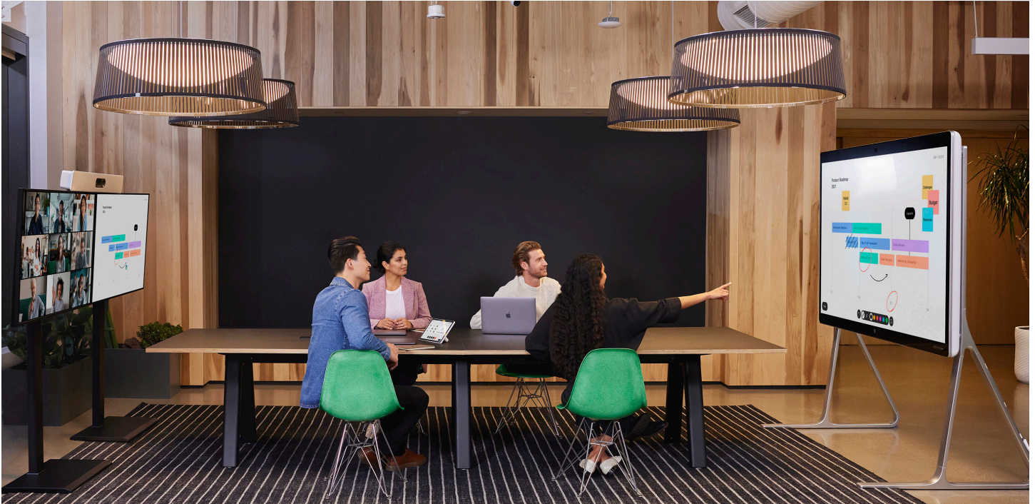
Figure 1. Webex Board 85 used for visual collaboration in a multi-screen environment