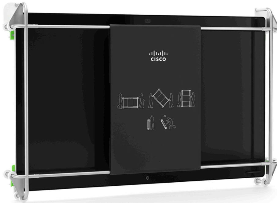
Figure 2. Webex Board 85 in new wheel-based packaging and transport frame