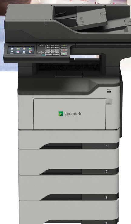
MB2546adwe with optional trays