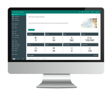
2N® ACCESS COMMANDER