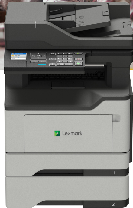
MB2338adw with optional tray