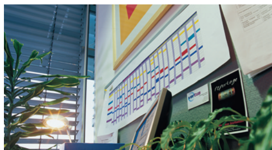
Project plan banners

The C9600's superfast speed and steadfast reliability are due in no small part to OKI Printing Solutions' expertise in single-pass digital LED technology. Not only does the flat, straight paper path mean higher speeds, minimal jams and smoother handling of a wide range of paper types and formats, it also boasts a robust and impressive 150,000 pages per month duty cycle.