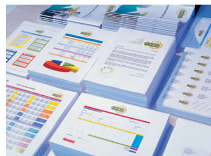
Large volume mail outs