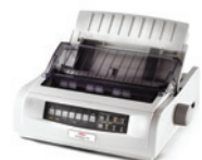
Dot Matrix Printers