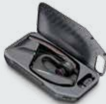
Charging case (Sold separately)