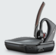
Charges while docked