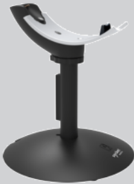
Charging Stand SKU# AC4159-1956