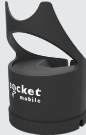
Charging Dock SKU# AC4133-1871