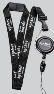
Lanyard - Black AC4100-1692