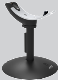
Charging Stand SKU# AC4159-1956