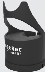
Charging Dock SKU# AC4133-1871