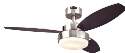
Reversible Wengue Finish Blades