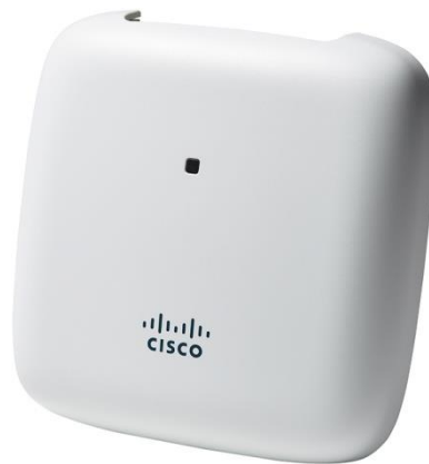
Figure 1. Cisco Aironet 1815m

With the increased coverage area, 802.11ac Wave 2 support, and the functions and features of an enterprise-level access point, the 1815m fully meets the growing requirements of wireless networks by delivering a better user experience (Figure 1).