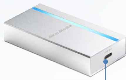
USB3.0 Type-C (output)