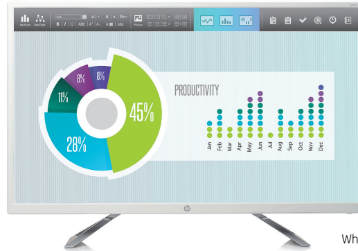
White and Silver Color

Experience stunning visuals in an expansive panorama with the HP V320 31.5-inch Monitor, which boasts a massive 31.5-inch diagonal FHD screen, narrow bezel design, and wide viewing angles at an affordable price.