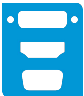
DVI-D, HDMI, VGA