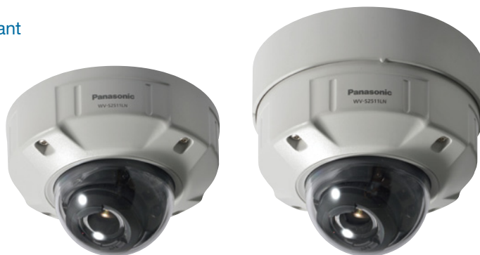
with Base Bracket